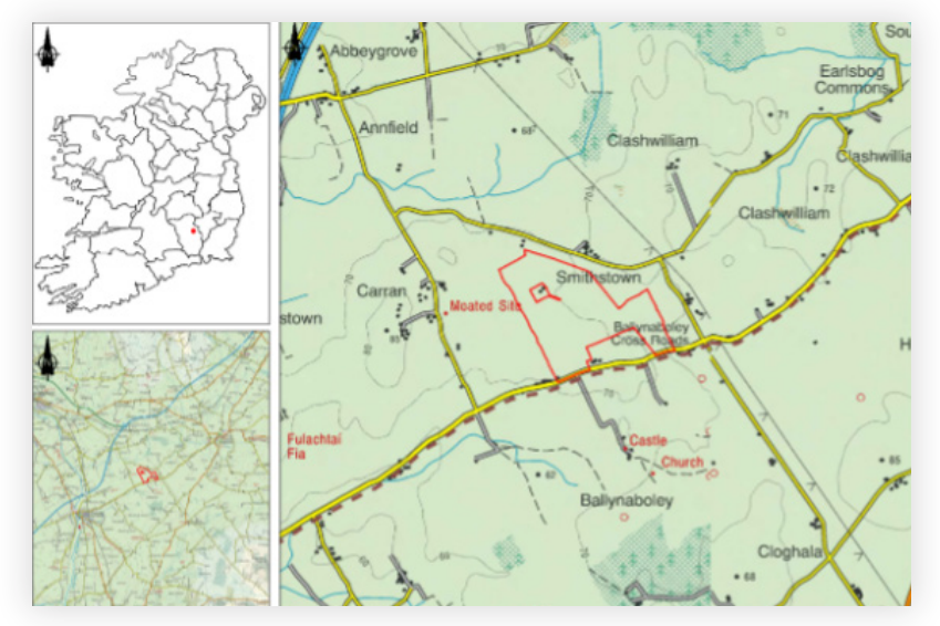
Figure 1 - Site location map of Clashwilliam Solar Farm.

Clashwilliam Solar Farm will connect to the electricity grid at Kilkenny 110kV (kilovolts) substation. A 5.7km (kilometres) underground cable will connect the Solar Farm to the 110kV substation. Construction of the Solar Farm will involve the installation of ground mounted solar panels on light steel frames and the installation of associated underground cabling.